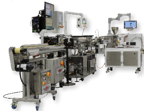
Extrusion line with 21" swiveling touchscreen