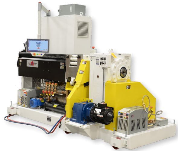
ULTRA Extruder with 15.6" swiveling touchscreen