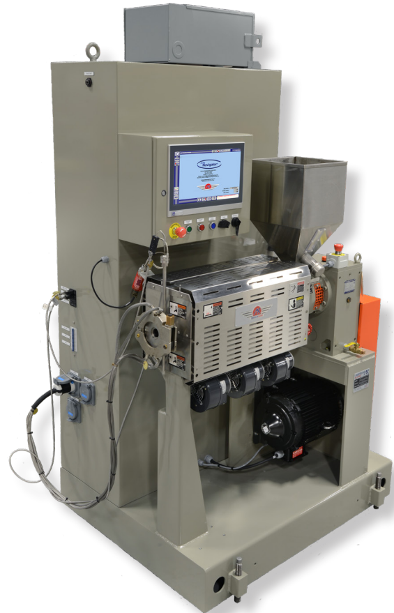
ULTRA Extruder with 15.6" panel mounted touchscreen