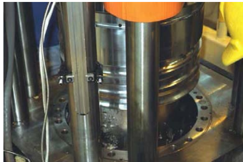
Diverter shown lifted out of the head body.

When finished, the diverter and plunger are lowered and fastened back into the head. You will be making good parts with a new color within a few shots.