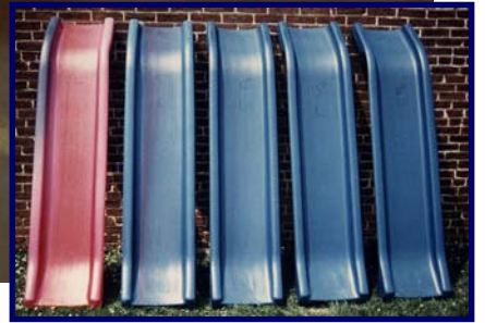
Color change from Cherry to Blue. (The slides above were pulled after every 5 shots, left to right.)