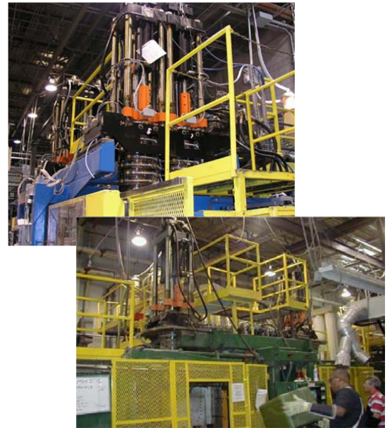
Four retrofit heads on a Producto double-double machine (top) and two GEC heads on a Hartig machine (bottom)